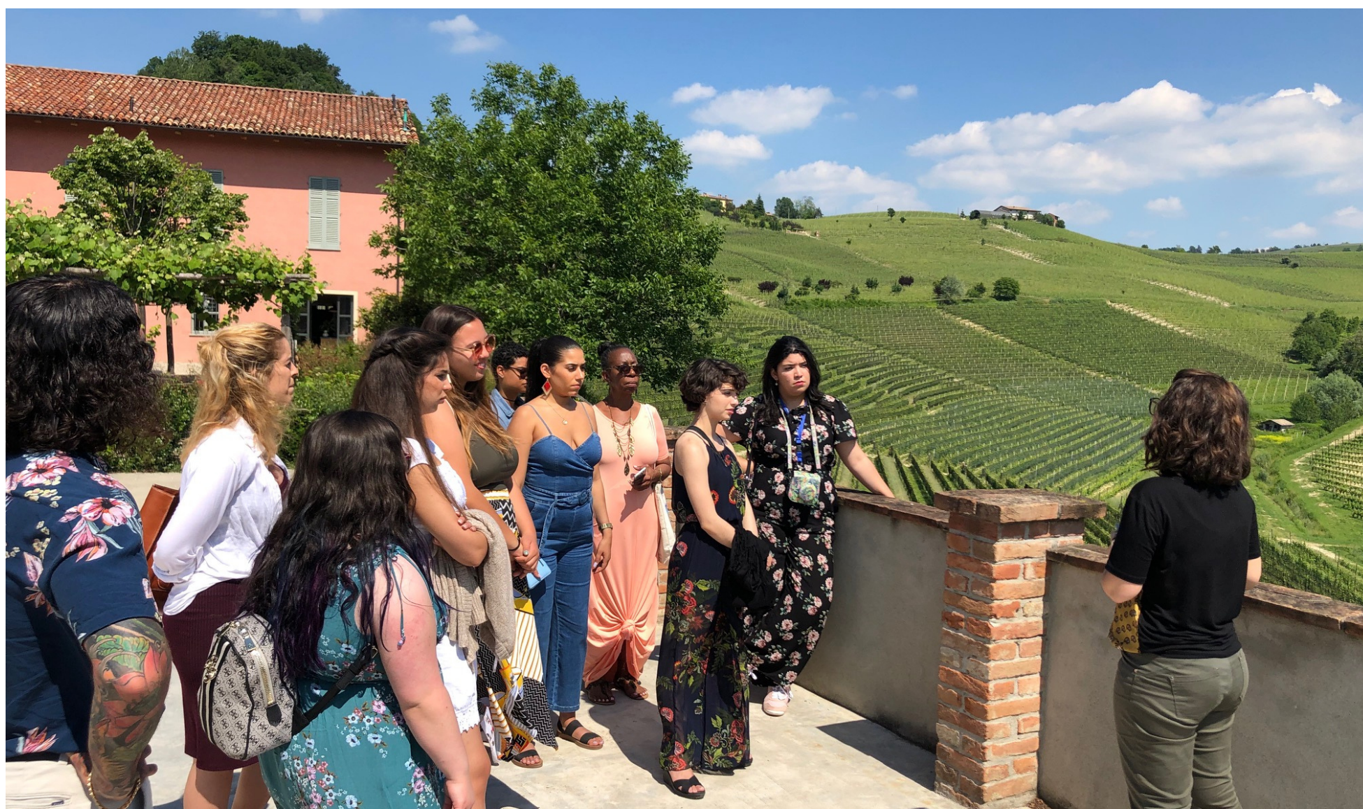
Visiting the Prunotto winery and vineyards in Barolo, Italy.

This program offers you the opportunity to explore first-hand what makes Italy special. You will explore scenic towns such as Cinque Terre, Camogli, and Portofino, as well as beaches and mountain trails a short distance from the city. Meanwhile you will reside in modern apartments located in or near Genoa's sprawling medieval quarter, giving you a daily encounter with a way of life that goes back many centuries. All in five weeks—it will be the educational experience of a lifetime!