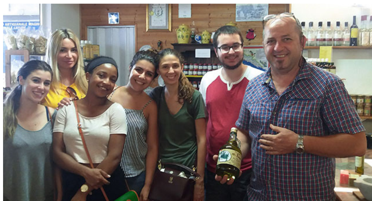
A visit to the Magnone Olive Oil Business in Finale Ligure, Italy.

The program fee does not include airfare, most meals, FIU tuition ($207.57/credit, 9 credits total) or the $175 study abroad fee.