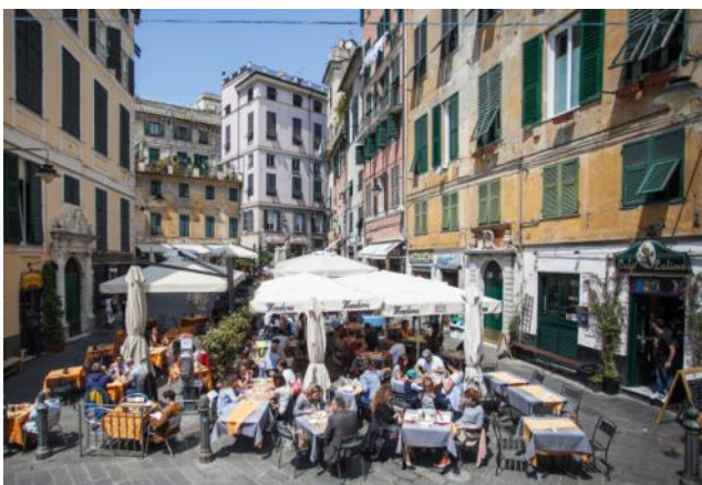
Old Town of Genoa

Giuliano: Old town is a UNESCO World Heritage Site; Via Garibaldi, where you find the grandiose Palazzo Rosso, Palazzo Bianco, and Palazzo Doria Tursi; San Lorenzo Cathedral.