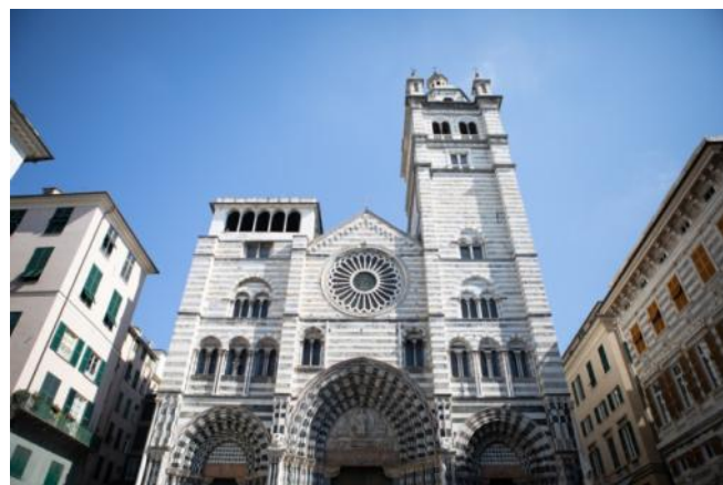
San Lorenzo Cathedral, Genoa