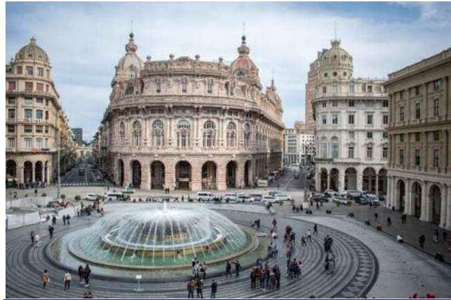
Piazza De Ferrari, Genoa