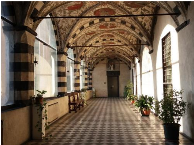
Santa Maria di Castello, Genoa