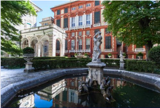
Palazzo Rosso, Genoa

Genoa is famous for the caruggi or vicoli , tiny medieval streets that run throughout the city; There are many amazing shops, cafes, and piazzas hidden within these streets