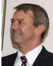
Catalin Ghenea Consul General of Romania