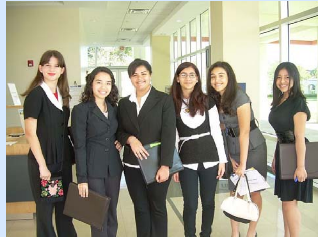
G. Holmes Braddock Senior HS