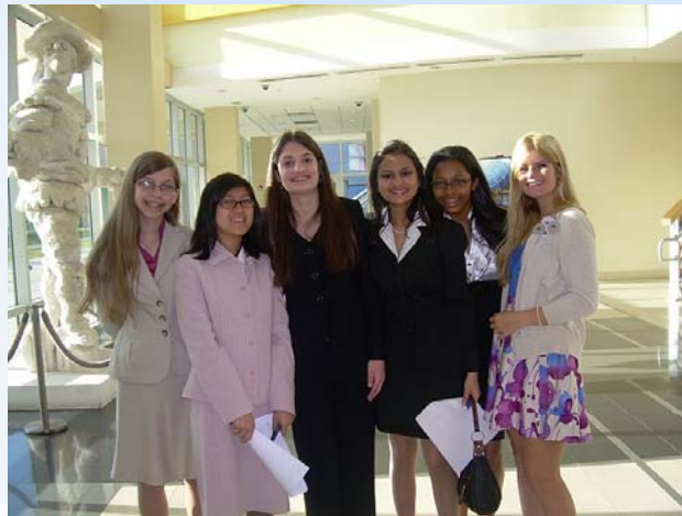
Miami Palmetto Senior HS