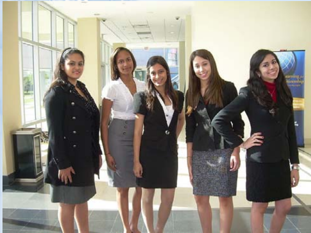
Coral Reef Senior HS