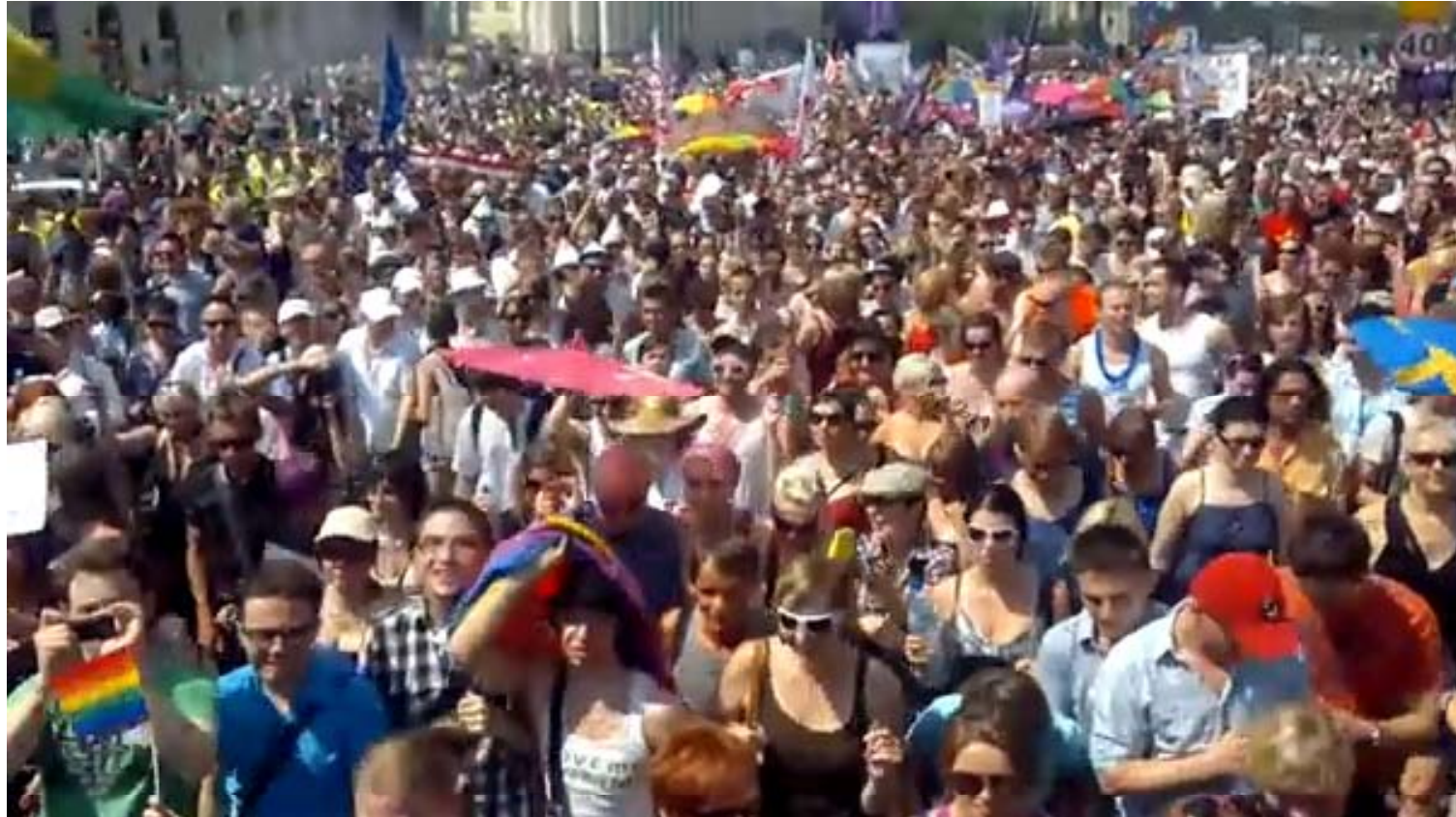
Europride parade, Warsaw, July 2010