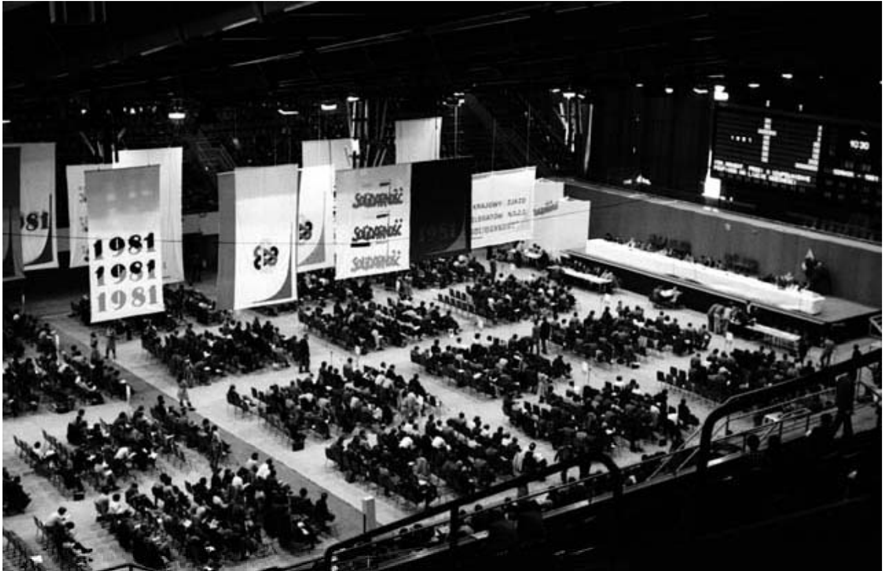
Solidarity Congress, Gdansk, September 1980