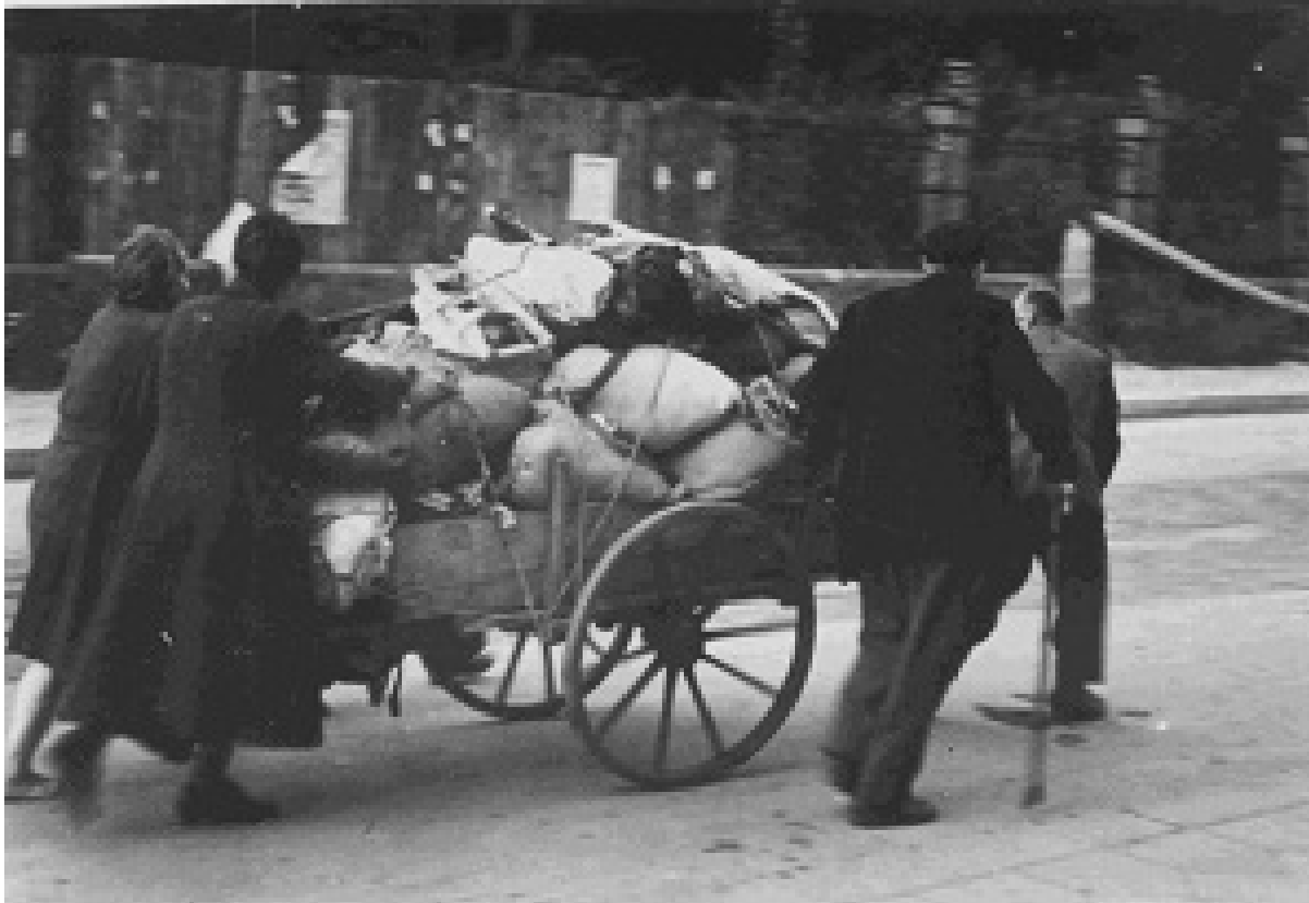
German expulsions, 1945-46

QuickTime™ and a decompressor are needed to see this picture.