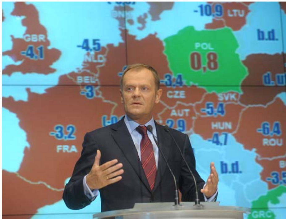
Prime Minister Donald Tusk in 2009...